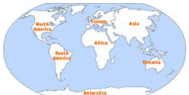
Locations of the seven continents.